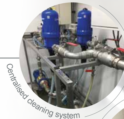
Centralised cleaning system