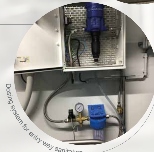
Dosing system for entry way sanitation